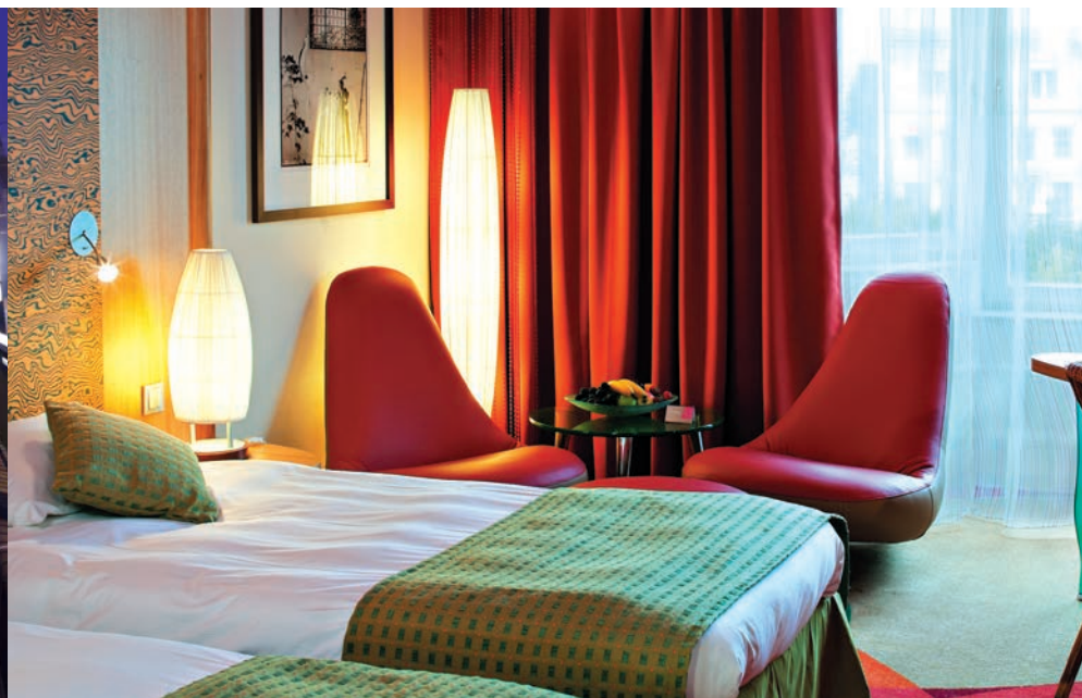
4-star accommodation at your luxury hotel in the center of Volvo's hometown. A great place to begin your European vacation.